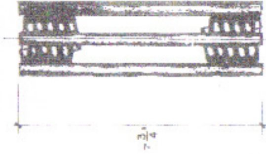
1" x 7 3/4" - 4 STRUT